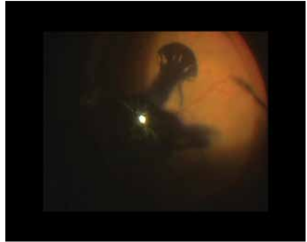
Fig. 2 - The diffusion of the dye highlights the extension of the vitreous detachment towards the periphery.